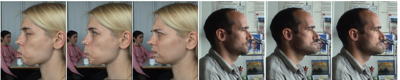
Fig 2: Automated facial fiducial points tracking in profile-face image sequences contained in the MMI Facial Expression Database

The database has been developed as a user-friendly, direct-manipulation application. The Graphical User Interface of the web-application is easy to understand and to use. On-demand online help and a flash (animation) demonstrating the path that the user