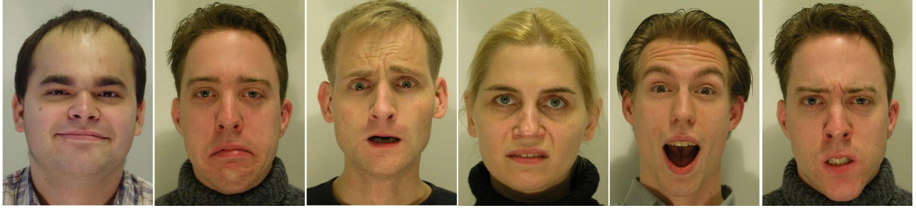
Fig 1: Examples of static frontal-view images of facial expressions in the MMI Facial Expression Database