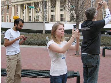
Figure 4. Mobiphos allows a group of collocated people to capture and simultaneously share photos.