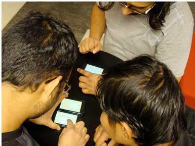
Figure 2. MindMap allows a workgroup to create, edit, and view virtual notes on any table.