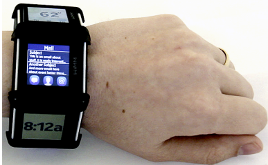
Figure 8. Facet is a multi-display bracelet consisting of independent touch-sensitive segments.