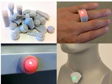
Figure 9. BitWear is a prototyping platform for small, wireless, interactive devices.

The results of the workshop will be summarized and published on the workshop's website 5 . Depending on the maturity of the submissions and the outcome of the workshop, we intend to write a special journal issue with an appropriate publisher to promote this research area.