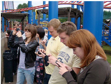
Figure 5. Automics allows people to capture, share and annotate photos amongst theme park visitors.