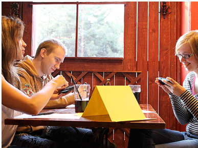
Figure 6. MobiComics allows groups of collocated people to create and edit comic strip panels.