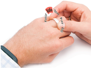
Figure 7. Nenya is a magnetic ring allowing simple input actions such as twist to select and slide to click.