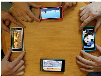
Figure 3. Pass-them-around allows people to share photos using the metaphor of passing printed photos.