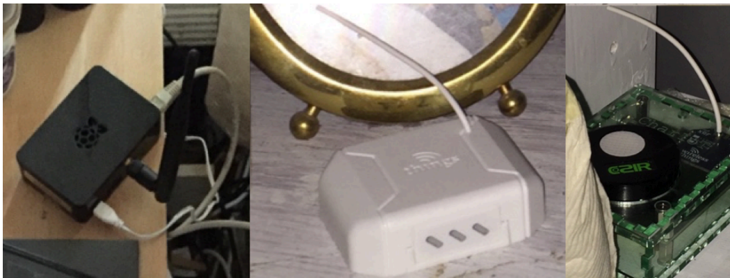
Figure 1. Hub (left), temperature/humidity sensor (middle) CO2 sensor (right) deployed in situ.