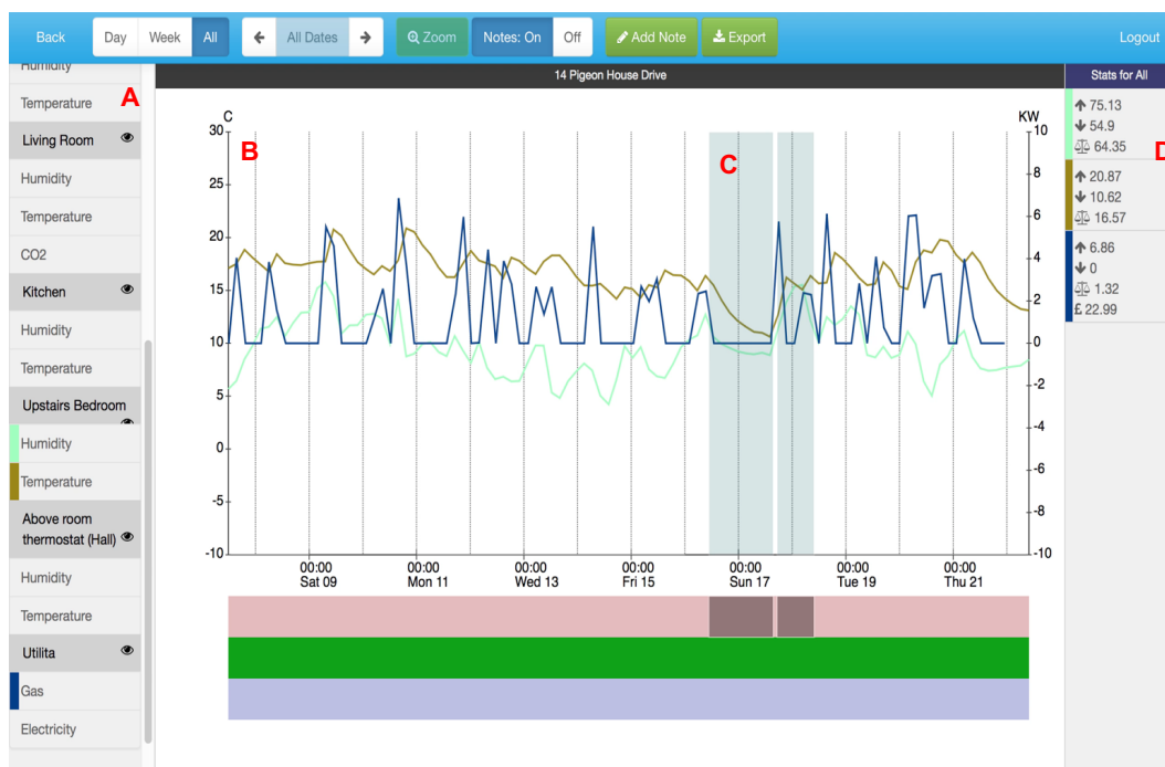
Figure 2. The interactive web app enables A) filtering (show/hide) of sensor data sources, B) pan and zoom time series line charts, C) annotations (highlights) viewable on click, and D) stats for selected sources (min/max, average, cost in £).

This beta-level system was then given to energy advisors to deploy in their own homes for testing, allowing them to get a feel of what it is like to have real data recorded and visualised. The workshop following this beta testing focused on understanding the ways in which advisors accounted for the data recorded in their homes and what issues if any they anticipated would arise as part of a live system deployment with real clients in the wild. Further refinements made to the system as a result of the beta testing included room-level filtering, PDF export, visual improvements, and general bug fixing. A final system was given to the advisors along with a training session on how to set up and deploy sensors.