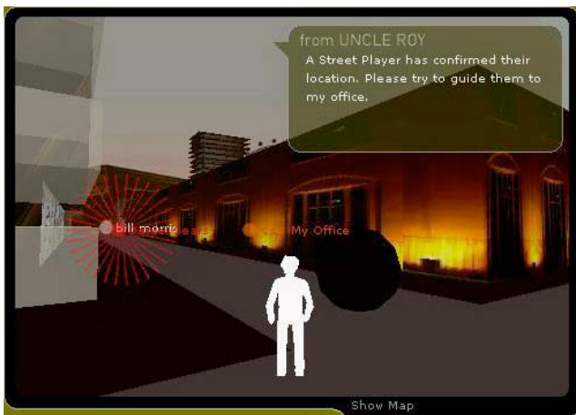
Figure 2. Online player.

Online players move around a virtual city which correlates with the real city via avatars. They are sent on a mission to meet Uncle Roy, which requires them to find one of four postcards located at specific locations in the virtual city. Initially they can chat with other online players via text messaging but cannot see or talk to street players. When a street player first declares his or her position a distinct avatar appears in the virtual world at that location. A street player ‘card’ also becomes visible to the online players and displays the street player’s name, photograph, and a brief description of their appearance and clothing. Selecting a street player’s card allows the online player to send private text messages to them. Only the most recent audio message from each street player is available online, each new message overwrites the previous one. Online players and street players are obliged to collaborate if they are to locate Uncle Roy’s office. Not only must the online player locate their postcard in the virtual city, the street player must retrieve it in the real city. When this has been achieved, the game server issues instructions to the online player which are used to guide the street player to Uncle Roy’s office.