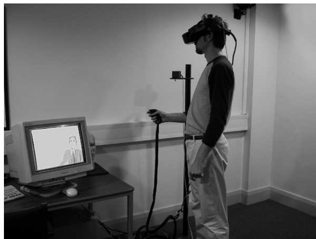
Figure 2: Participants in the HMD could not see their own bodies or physical surroundings while in the IVE. The image of the IVE visible on the screen was for the benefit of the researchers.