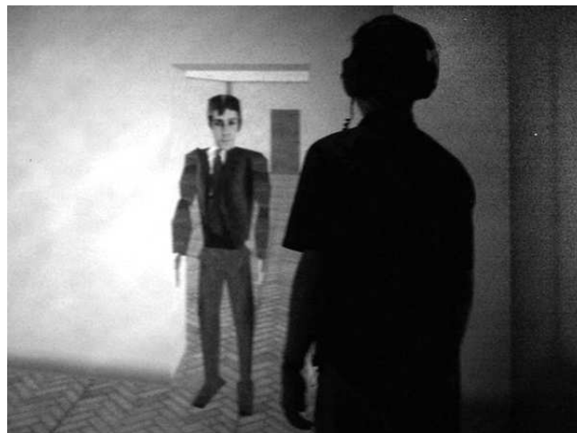
Figure 1: Participants in the Cave could see their own bodies

Both participants had wireless microphones attached to their clothing. These were activated only for the duration of the conversation.