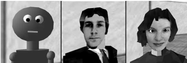
Figure 3: Lower-realism avatar, higher-realism male avatar, higher-realism female avatar

Each participant was represented by a visually identical avatar as we wished to avoid differences in facial geometry affecting the impact of the animations. Each avatar was independently driven for each user. The participants in the HMD, who were visually isolated from the physical surroundings of the lab, could see the hands and feet of their avatar when looking down; the participants in the Cave could only see their own physical body. This means that participants never saw their own avatar in full, so they were unaware that both were visually identical. In the lower-realism condition a single, genderless avatar was used to represent both males and females (Figure 3). For the higher-realism avatar, a separate male and female avatar were used, as shown in Figure 3.