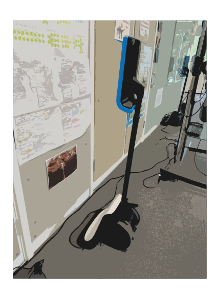
Figure 1: A Double 3 MRP robot parked in its dock

The lab purchased five Double 3 MRP robots [23], with the intention of having one for each floor of its building. The robots consist of a 9.7 inch touch screen, equipped with a microphone, camera and speakers, attached on a pole (of remotely adjustable height) which is then attached on a gyroscopically-stabilised two-wheeled base. Each robot comes with a docking station, which is plugged into an electrical socket and allows a docked robot to charge (figure 1).