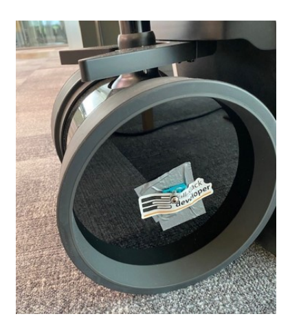
Figure 2: Cat bells were attached to the robots' wheels

of the sound, she was able hear it and know when a robot was in use near her. Moreover, sighted, on-site users have found it useful to be able to hear when a robot is approaching, as they had also previously found the stealthy movement of the robot unsettling. We did not have the opportunity to assess accessibility for other needs.