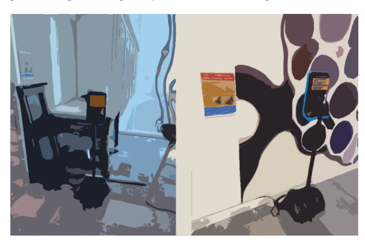
Figure 4: Robot docking locations in different areas of the building

There were not many places in the lab's building to satisfy all these requirements. Most areas that were away from desks were fire exit pathways which could not be blocked. In non-pathway common areas, such as collaboration spaces and kitchens, there were not always sockets behind walls and using a nearby floor socket would lead in exposed cables causing a tripping hazard. There also were not many empty walls against which a robot could stand without being awkwardly placed between furniture and other equipment. In some cases, we had to make compromises with regards to ideal placement, prioritizing safety over convenience (Figure 4).