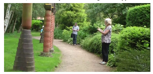
Figure 4. Standing back from Chimney Stacks

Finally, other instructions were challenging because they demanded impossible actions, for example "This man has brought you an apple. Why don't you take it and put it in your pocket? Or maybe you would like to eat it?" at Golden Delicious couldn't be followed literally. Most visitors were not able to interpret it as a clear instruction for action and remained stood still in front of it. However, a few (only 5 out of 29) made attempts to touch or grab the apple.