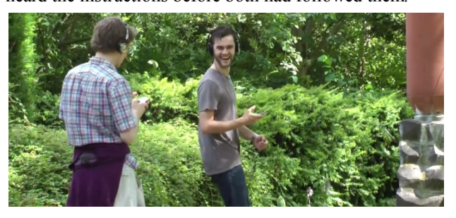
Figure 5. Exchanging glances while engaging

There were, however, many examples of tacit coordination in synchronizing engagement with sculptures. We noted earlier that pairs generally tried to begin their engagement together. However, the two devices were not technically synchronised and so there was often a few seconds delay between them. We often observed a quick exchange of glances and smiles between pairs to confirm that they had heard the instructions before both had followed them.