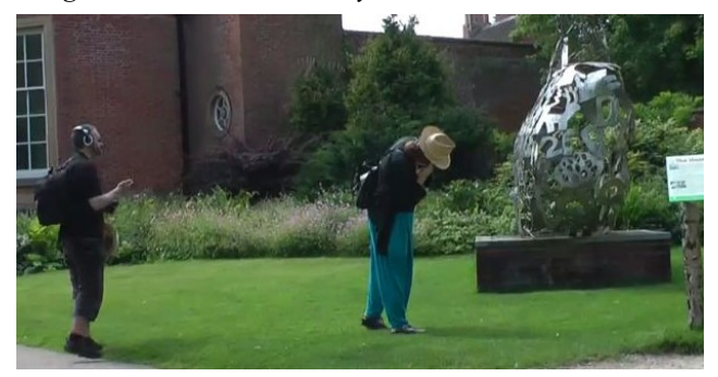
Figure 3. Reading the text at The Hand

Instructions that required a slightly higher level of physical engagement, such as touching a sculpture or adopting a pose, were often followed. Upon hearing an instruction, most visitors did not hesitate before carrying it out and remained physically engaged throughout the music. For example, at Two Vessels ("Take your hands and move them down the pillar to feel the texture") visitors would typically hear the instruction, approach the sculpture to begin feeling it, and remain at the sculpture, touching it and looking at it, until the music had faded. This level of compliance at Two Vessels was displayed by 22 out of the 29 visitors (as shown in Figure 2). Most visitors welcomed being given license to touch the sculptures: "I especially liked ones where it was like 'touch it', because I always want to touch sculptures and I'm never sure if you're really meant to". Indeed, we observed that once instructed to touch one sculpture, visitors became more tactile with subsequent sculptures. However, some remained nervous at breaking what is seen as a taboo behaviour: "I'm very conscious of walking through art when you're not allowed to touch ... the very first one it said 'what does it feel like?' and I just thought, I can't touch it, surely?"