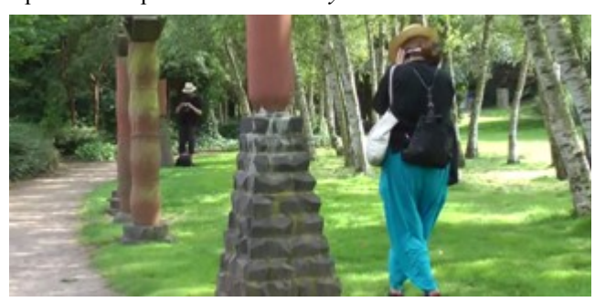
Figure 6. One partner waits while the other replays the music

Physical contention for the sculptures was usually not a problem as the garden was relatively quiet, but there were a few problematic cases where limited physical access meant that one partner had to wait for the other, for example at The Shrine at Nemi where visitors are invited to climb the steps and look through a small aperture. Chimney Stacks provided another example of coordinating actions, with cases of one partner following the other, sometimes copying their actions in solidarity, but with at least one case of one partner marching ahead and the second following with reluctance. Local coordination was also evident when one partner would wait nearby while the other replayed a music track before both moved on together, as we see in Figure 6 where one partner takes photos while the other repeats her experience at Chimney Stacks .