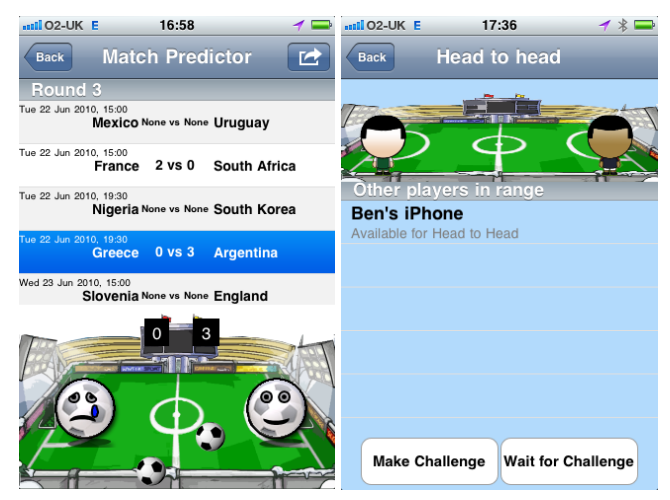
Figure 1. Screenshots from the WCP: the Match Predictor for the current round of matches (left) and the Head to Head page that allowed play via ad hoc networking (right).

matches in the current round, this constraint being designed to encourage continued engagement as users had to interact with the application at least once per round to continue to earn points. The deadline for submitting predictions for a given round was the kick-off time of the first match in that round. At the end of each match, the server allocated points to users with correct predictions and recalculated the leaderboard. Figure 1 shows screenshots from the application.